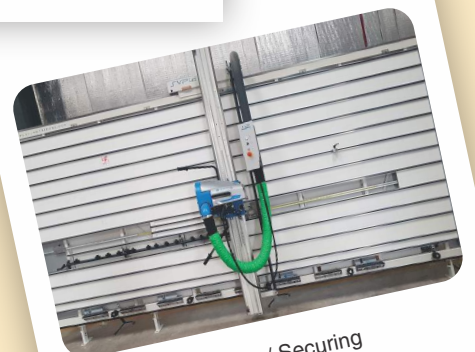
Lashing / Securing